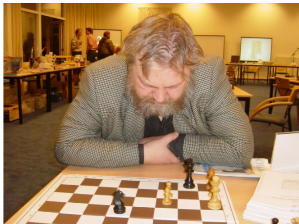
Yusupov solves a study

"In addition to providing excellent material for training one's calculating abilities, endgame studies open a window into the artistic side of chess. The van der Heijden database is widely recognised as the premier reference source for studies". GM John Nunn, 2010.